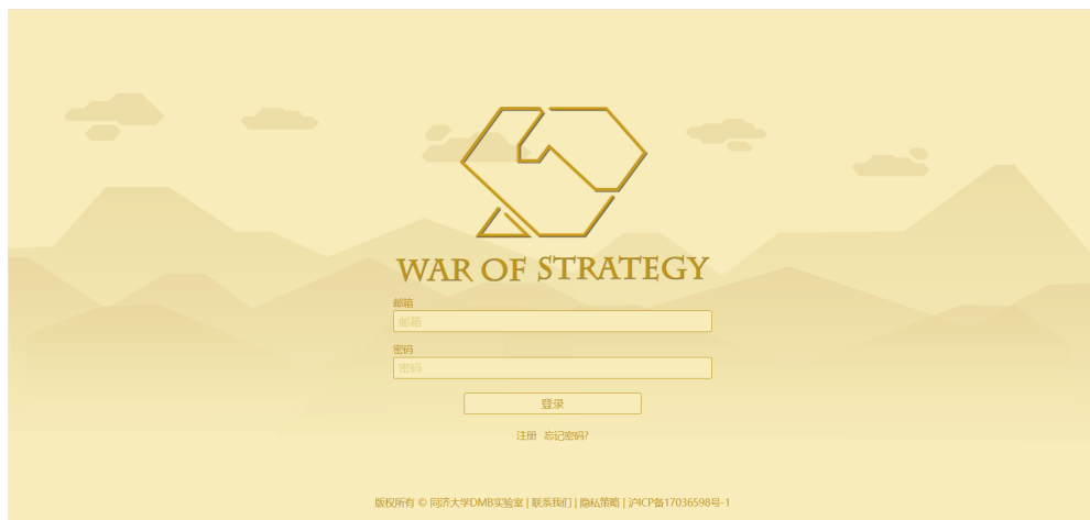
Fig. 3 Login page of the WoS.