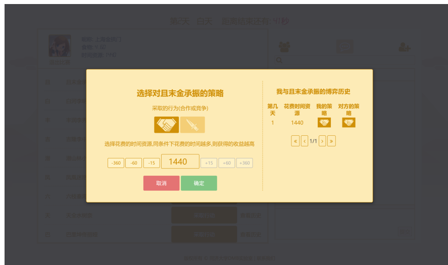
The left panel shows: Choose a strategy to play with [nickname] The move to take (Cooperate or Compete) Assign the time resource. The more time resource you use, the more food you will gain in the same condition. Cancel — OK The right panel is the same as that shown in Fig. 5. Fig. 6 The modal dialog box of request composing.