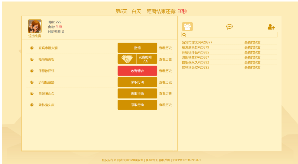
Fig. 4 The main part of the experiment.