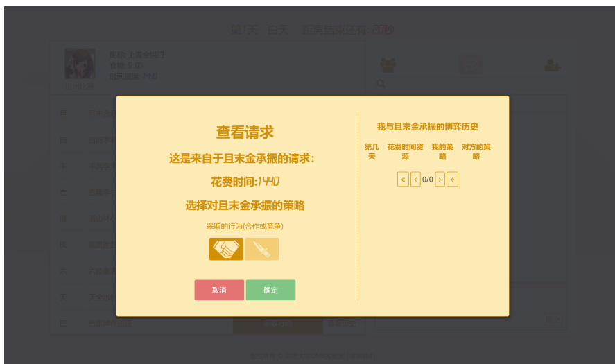
Fig. 7 The modal dialog box showing that the participant accepts the request.