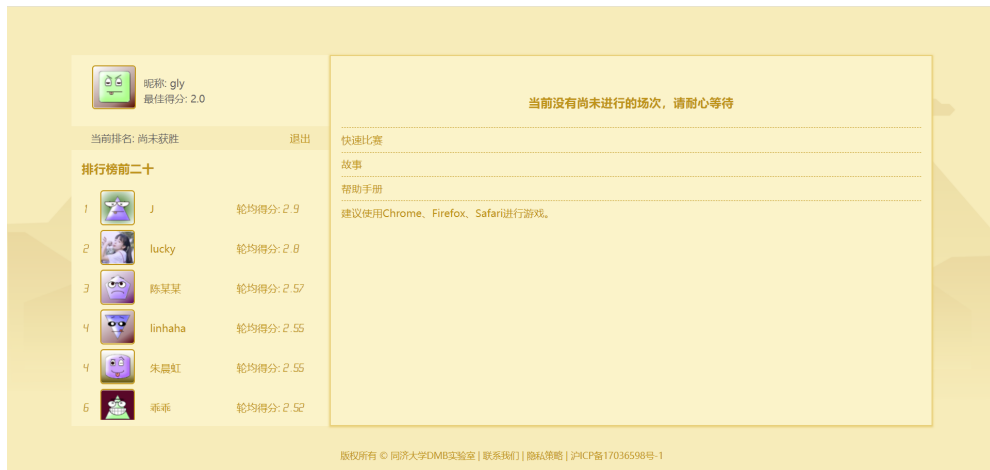
Fig. 2 Landing page of the WoS.